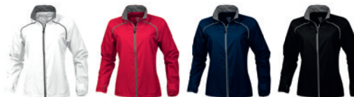
01 white 25 red 49 navy 99 black